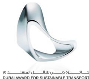
جائزة دبي للنقل المستدام DUBAI AWARD FOR SUSTAINABLE TRANSPORT